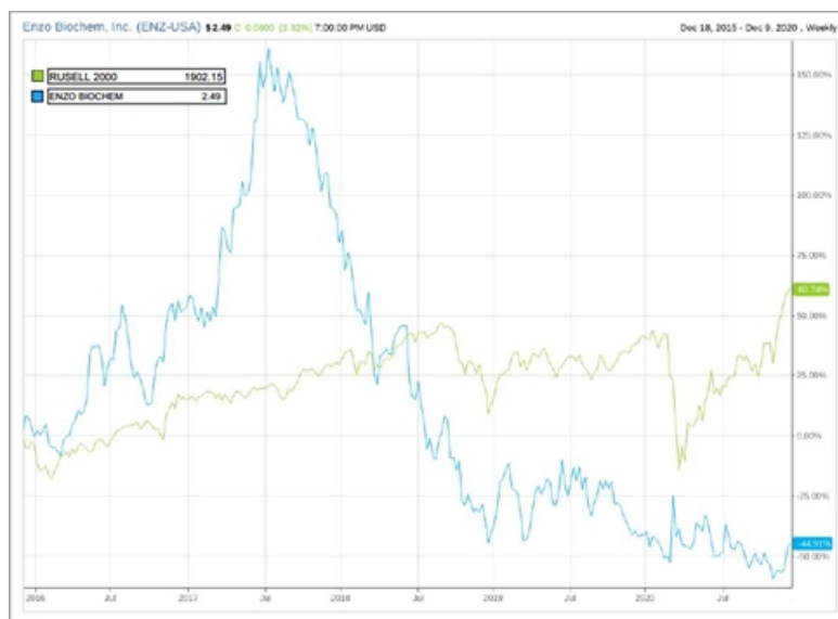
ENZ Stock vs. Russell 2000 for the past five years.

Source: Factset.com; peers are proxy peers named in the ISS report